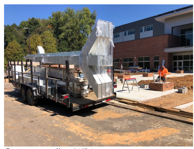
Canopy install at WPA