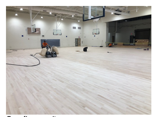
Gym floor sanding