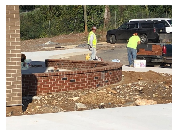
Art room seat wall at WPA