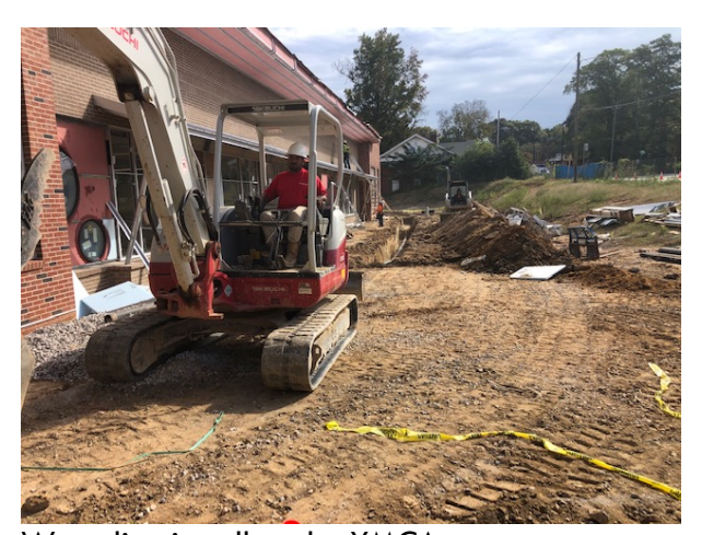
Waterline install at the YMCA